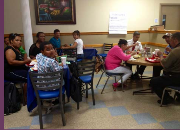
SEIU 615 Airport Workers at Lynn Meeting