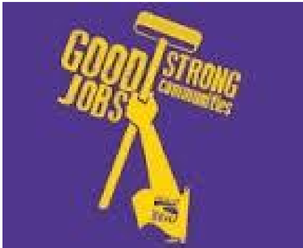
SEIU Local 615 logo