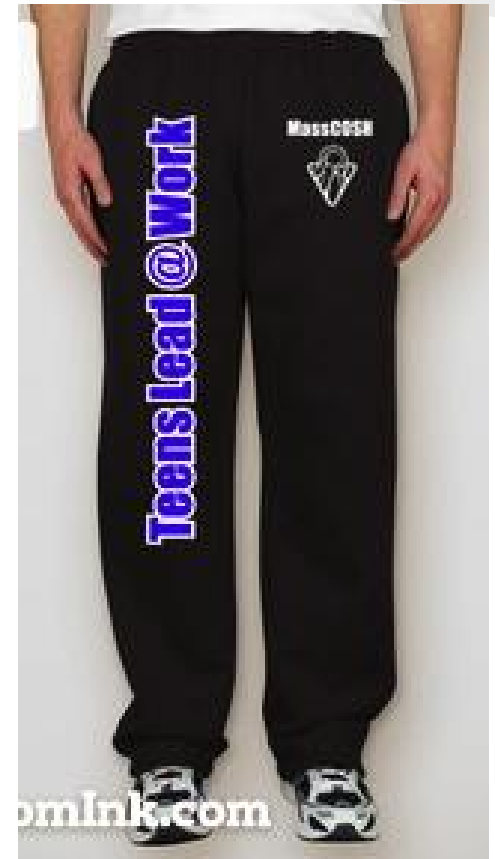
Teens Lead at Work giveback