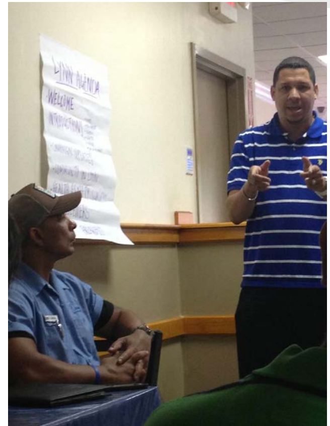
Organizing airport workers in Lynn, MA