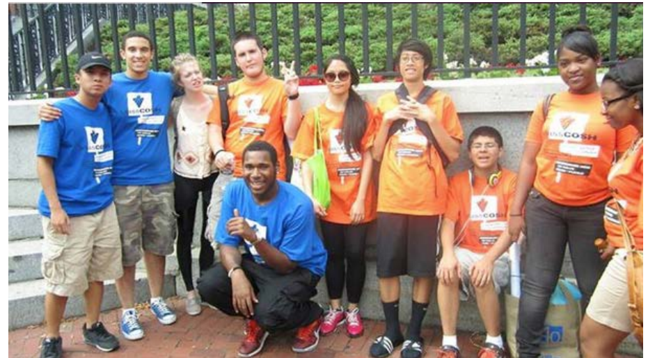
Peer leaders and OHIP intern Sophie at Raise Up Rally