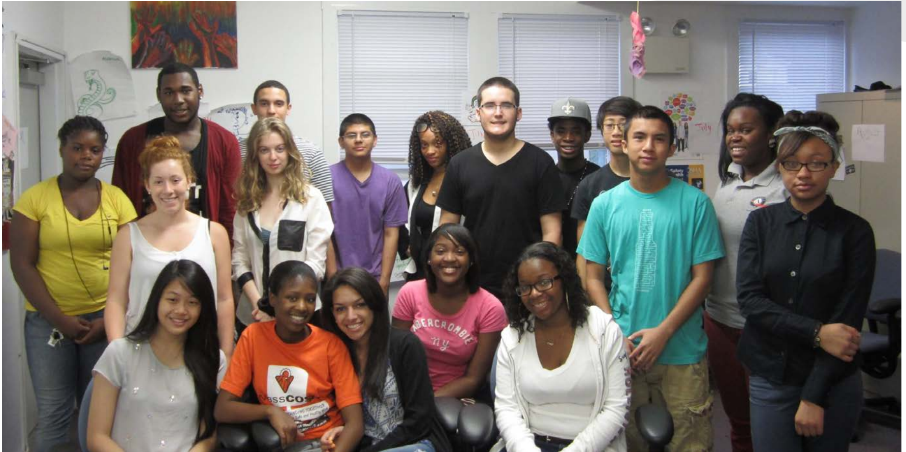
OHIP interns with the TLAW staff, day 2 of programming