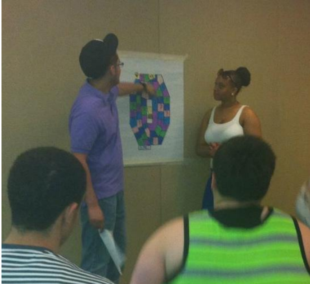
"Disaster Blaster" workshop