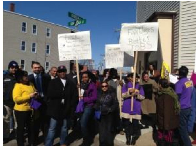
Airport workers protesting for better wages