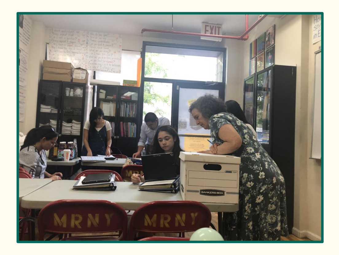
First survey session - July 10, 2019